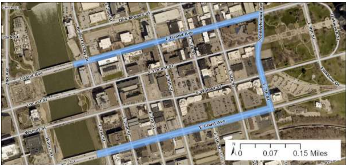
East Village area designated for Type “G” sound permits with street closure. Allows street closures with amplified sound between the hours of 9:00 a.m. and 10:00 p.m.