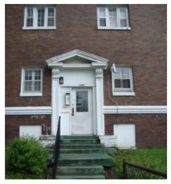
Front Entry – 1354 8<sup>th</sup> Street 6 units, currently vacant

A committee of funders and the Transformation board members have been meeting every two weeks to assign tasks and determine the next steps. A contract should be executed with the Transformation Board in July to begin the work on 1354 8<sup>th</sup> Street with a ninety day completion. The other two buildings will proceed to contract in the next few months.