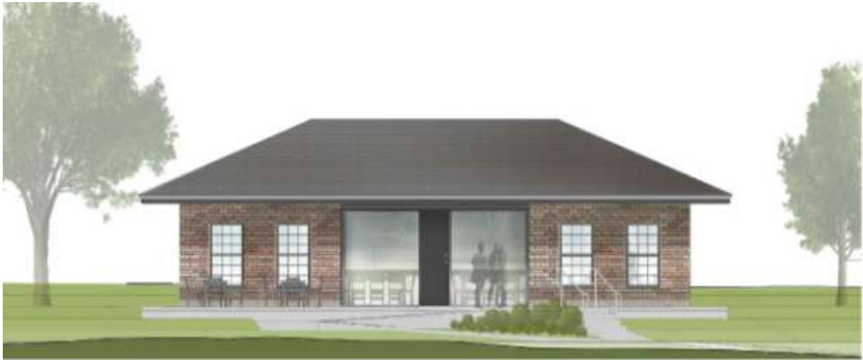
Shelter Elevation – east building façade