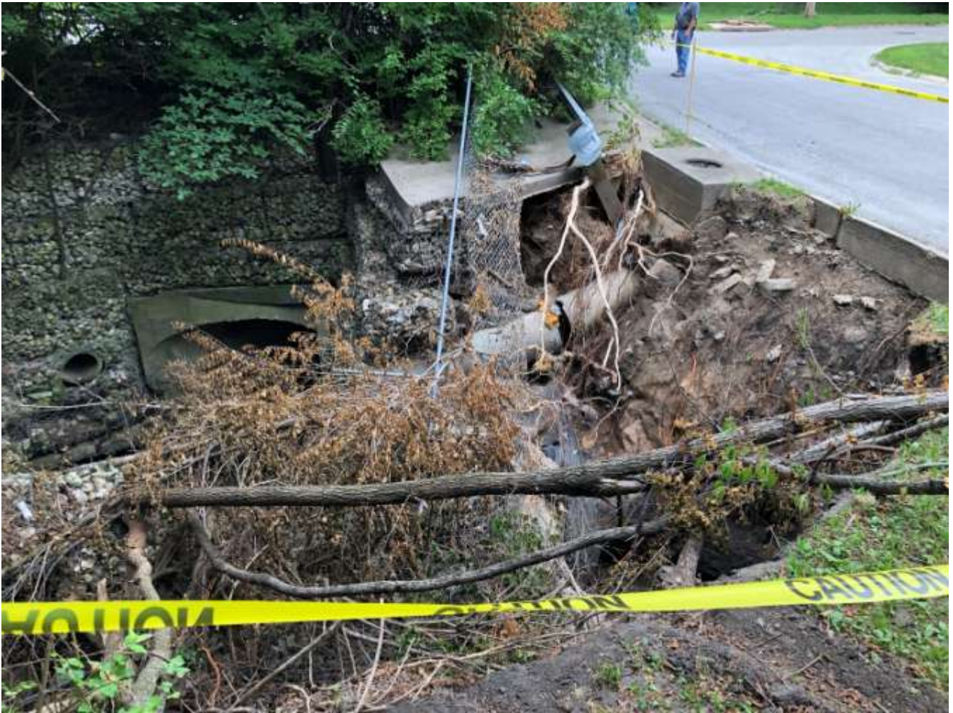
Flood damage near 38th Street and Amick Avenue