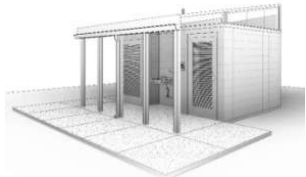
Sheridan Park Restroom Rendering