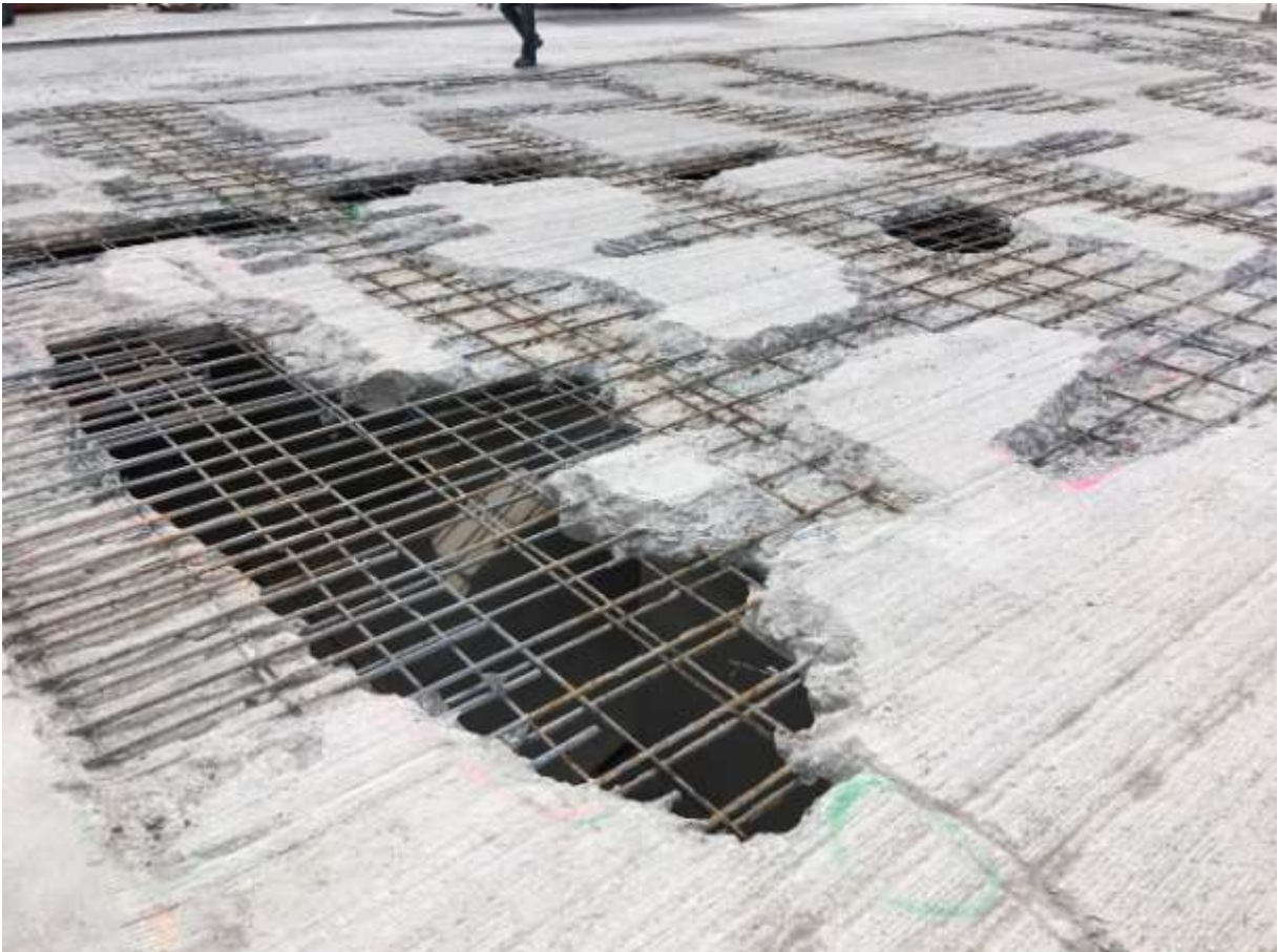
Full-depth (Class B) and shallow-depth (Class A) repairs, west span (typical).