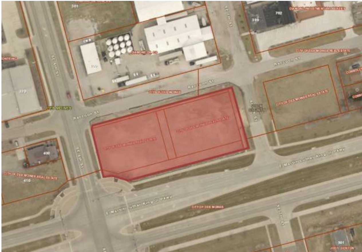
Project Vicinity Map