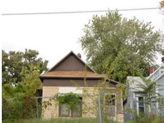
1311 Laurel Street