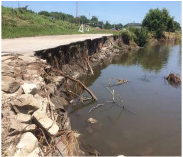
Gay Lea Wilson Trail – Flood Damage