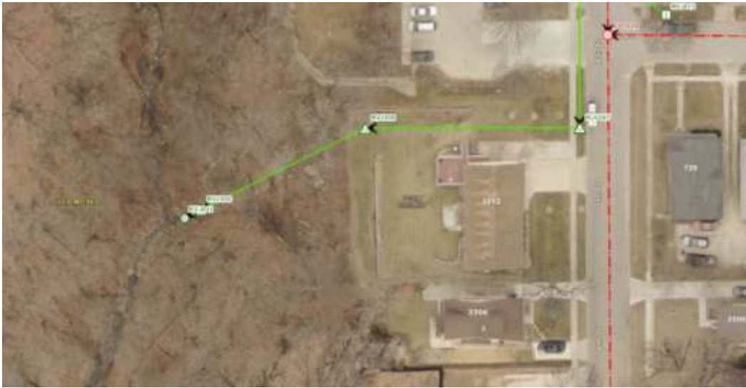
McHenry Park – Location of Repair