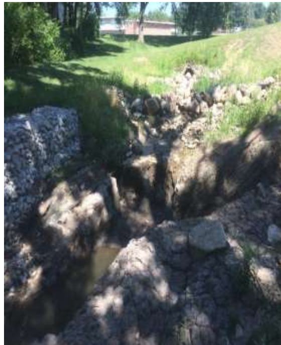
Harmon Park – Flood Damage