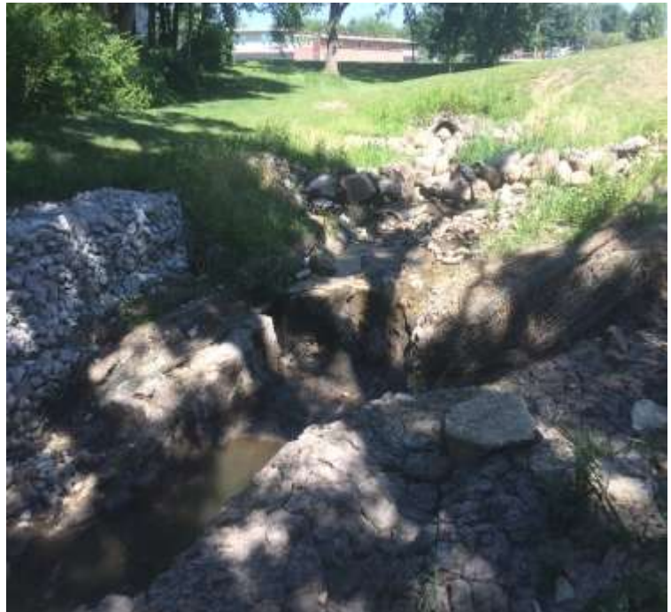
Harmon Park – Flood Damage