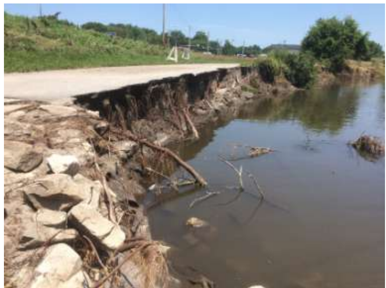
Gay Lea Wilson Trail – Flood Damage