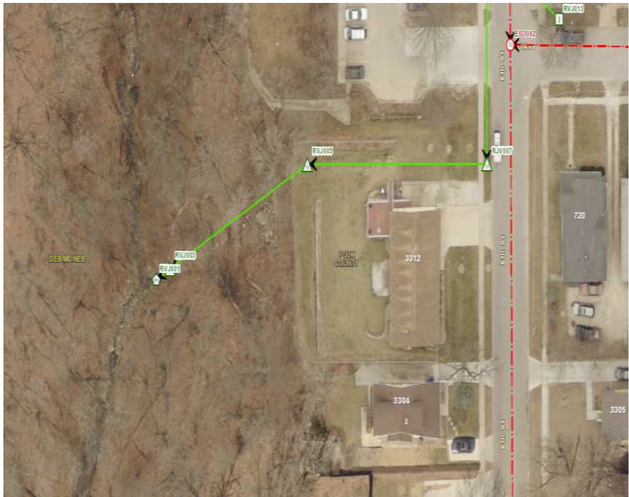
McHenry Park – Location of Repair