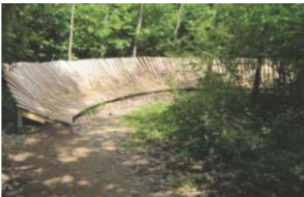
Wooden berm for high speed cornering