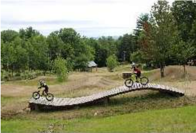
Double Roller with drop off