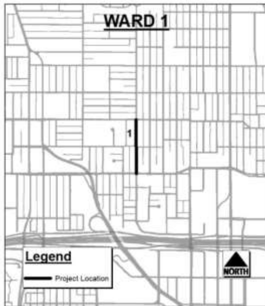
1. 13th St - Forest Ave to University Ave