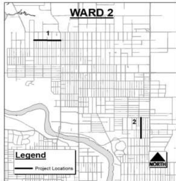
1. Madison Ave - 6th St to 11th St 2. E 13th St - Arthur Ave to Thompson Ave