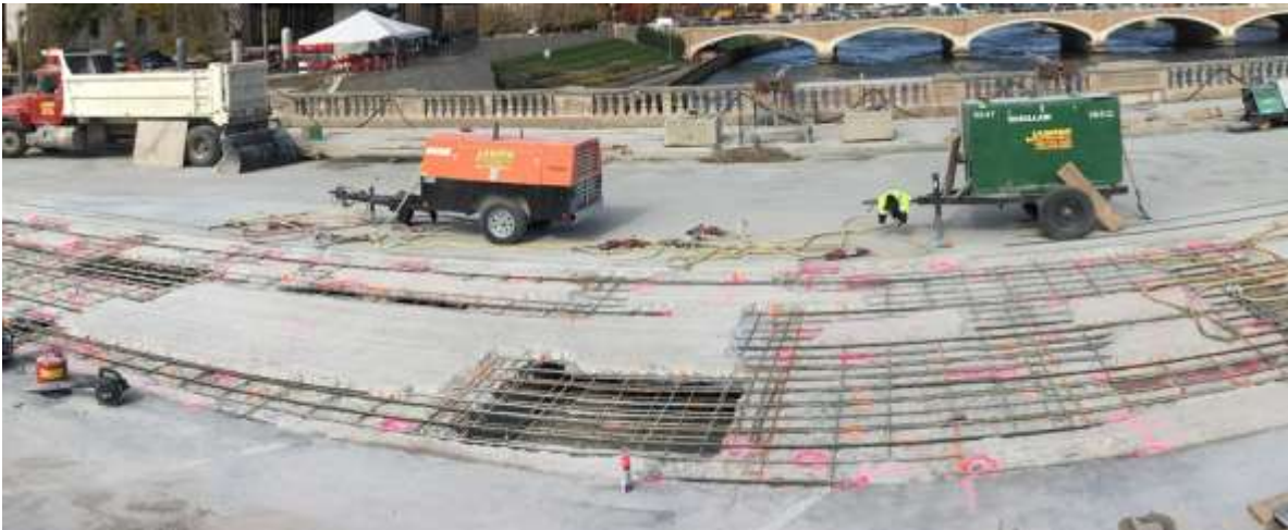
South side of bridge deck, west bridge span (Court Avenue)

anodes were installed to help protect the reinforcing steel from future corrosion. The picture below depicts areas of additional deck repairs required.