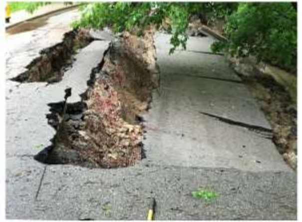
Image 1: View looking southwest of the north end of the affected pavement section on May 24, 2019.