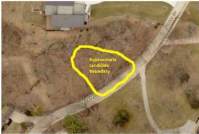
Site Map: Overview of the approximate landslide boundary.