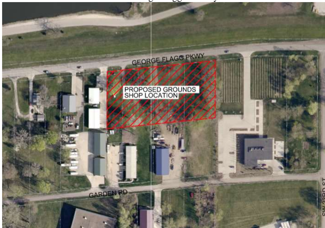
2400-2500 George Flagg Parkway Parcel