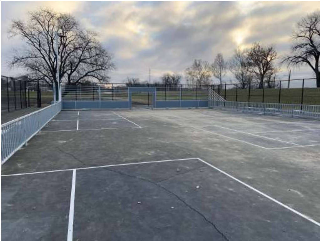
Futsal court installed.