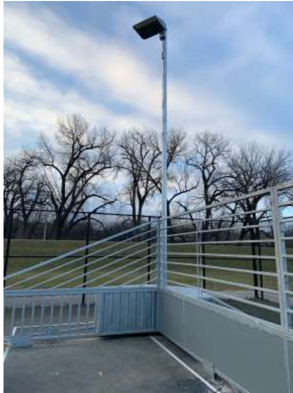
Light pole located on two (2) corners of the futsal court.