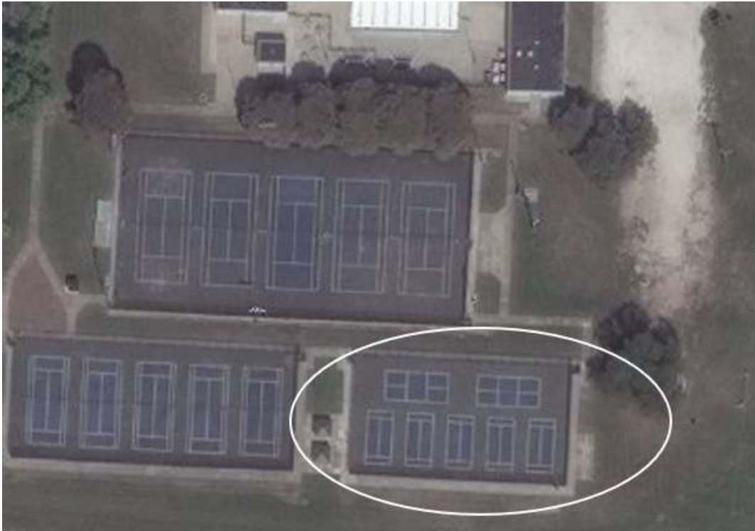
Location of futsal court at Birdland Sports Park.