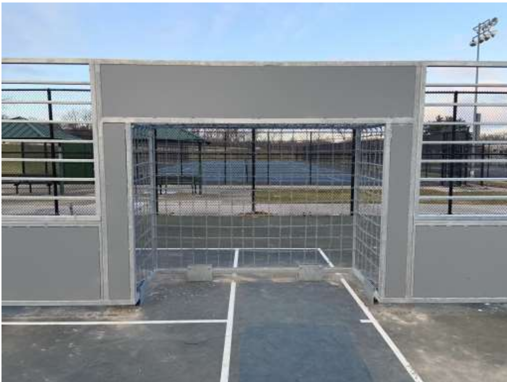
Goal (located at each end) on the futsal court.