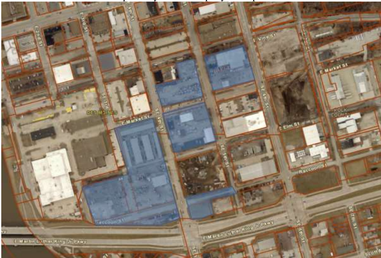
Map of City-owned Property in Proposal