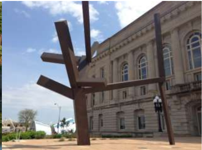
Unnamed Shapiro Sculpture