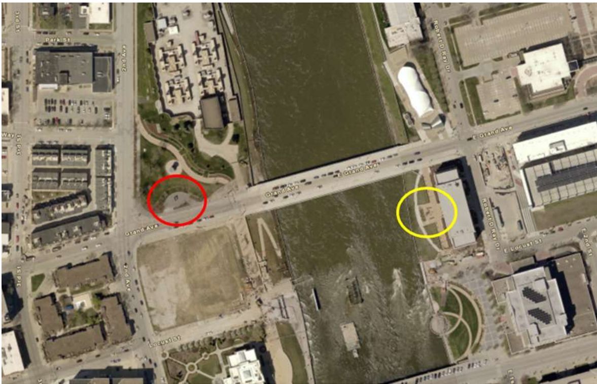
Red = Location of Quantum Leaf