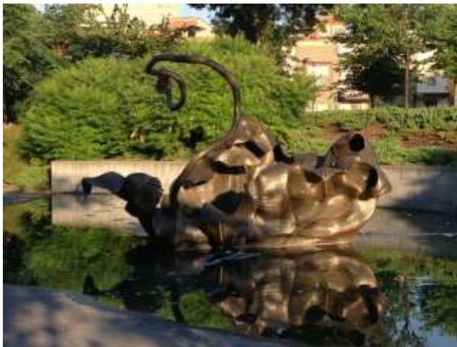
Quantum Leaf Sculpture