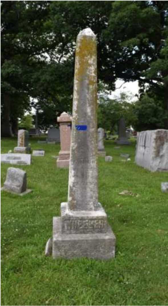
Before: Limestone monument leaning, uncleaned.