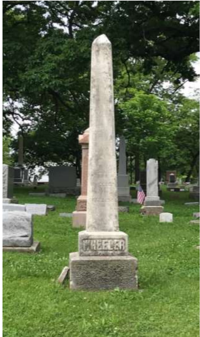
After: Limestone monument reset, cleaned