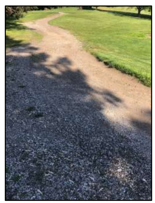
Grandview Golf Course Cart Path Current Conditions