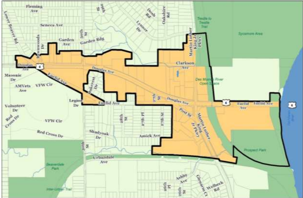
Map 1 - Boundary of Urban Renewal Area