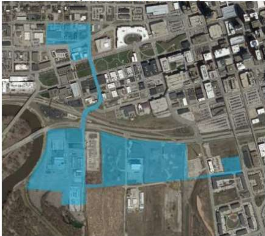
Map of the IRA District Boundary