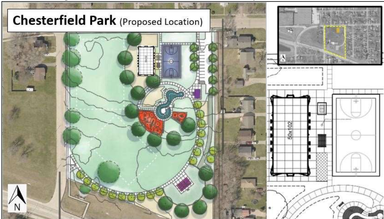
Proposed location of the Mini-Pitch Futsal Court System at Chesterfield Park: