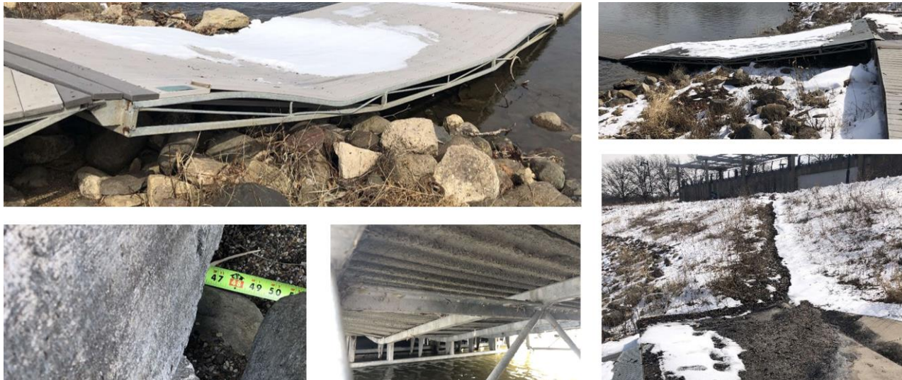
Series of Photos Showing Damage from 2021-2022 Winter Season