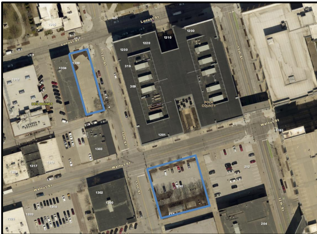
Exhibit: Parking lots located at 1300 Locust Street and 1290 Walnut Street

Paid parking every day at a rate of $60 per month. The charge for prepaid special events is $5 to $10 and can be adjusted in accordance with Municipal Code Section 114-666 in Division 5.