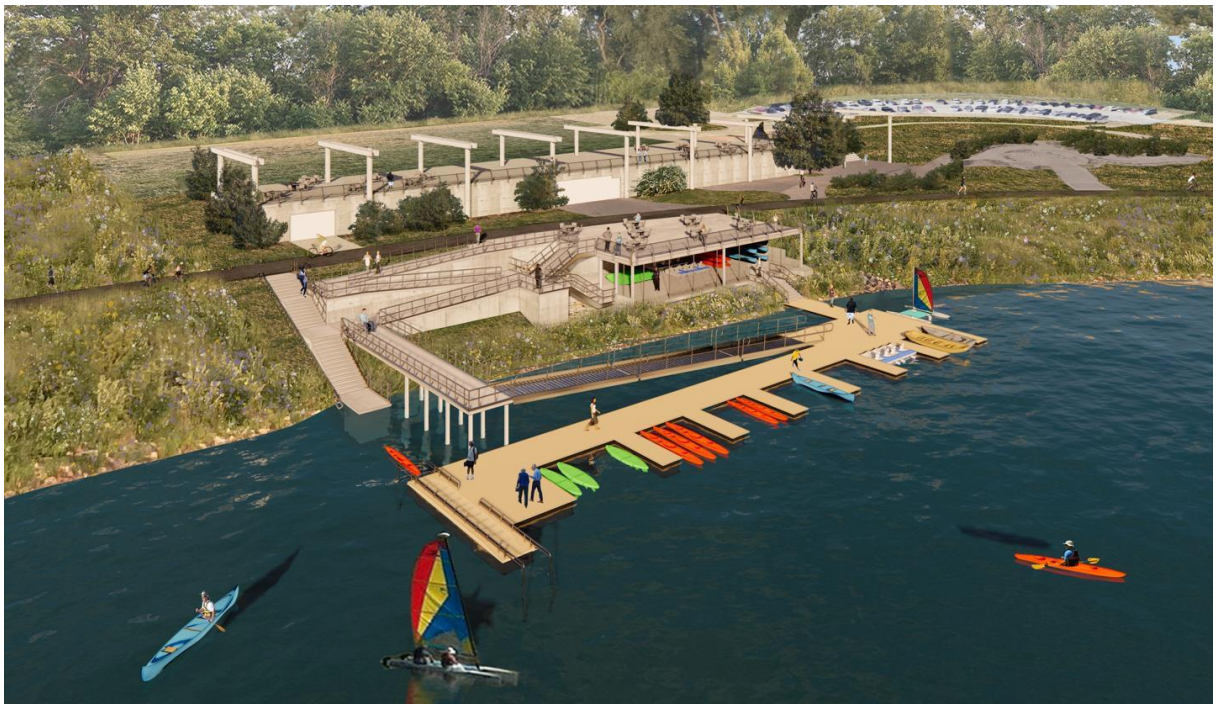
Rendering of Proposed Paddlecraft Marina Development