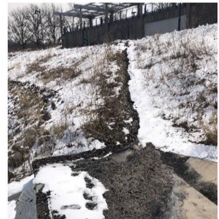
Series of Photos Showing Damage from 2021-2022 Winter Season