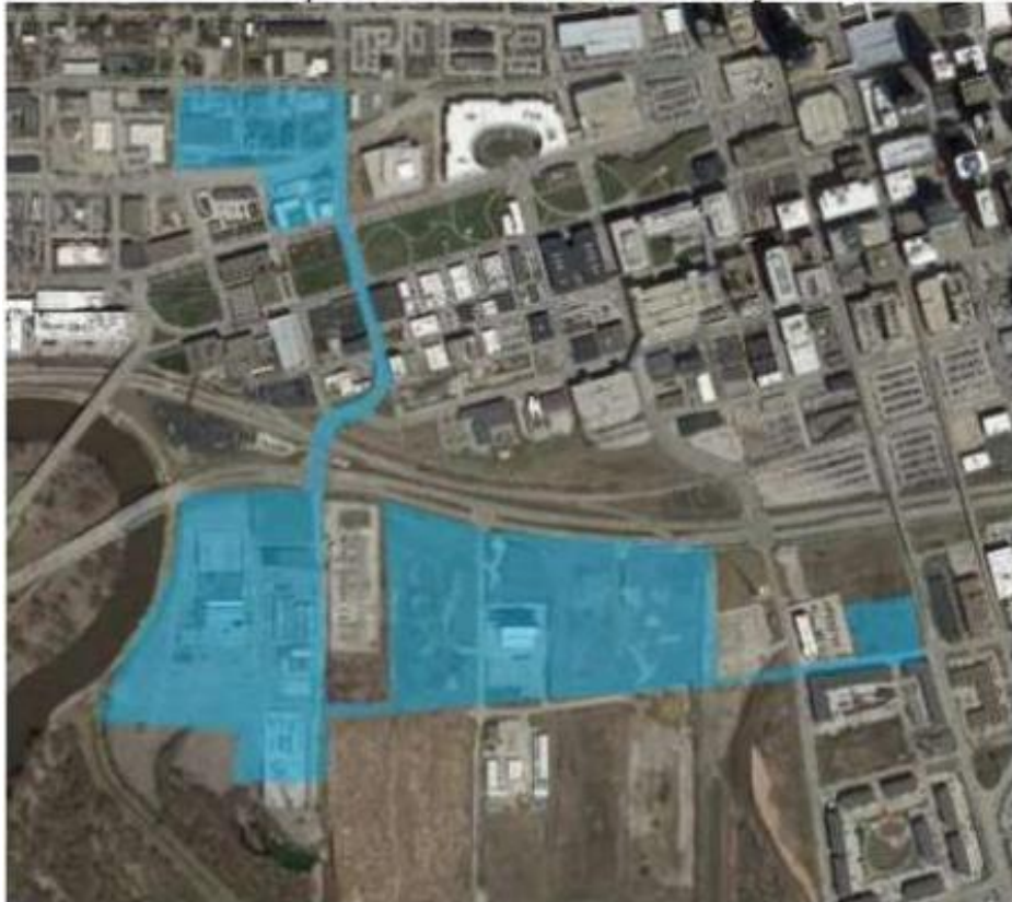
Map of the IRA District Boundary