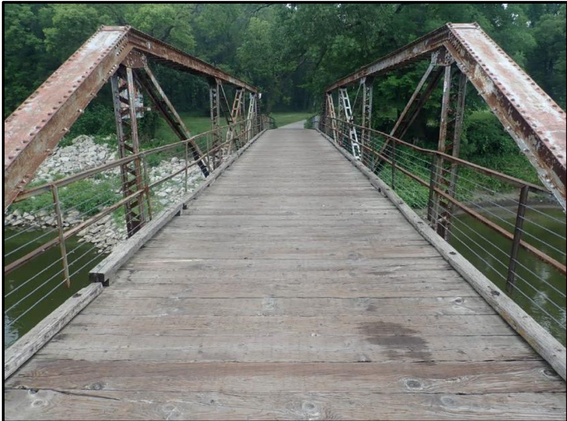
Above Photo: Trail View Looking North at Bill Riley Trail Bridge over the Raccoon River