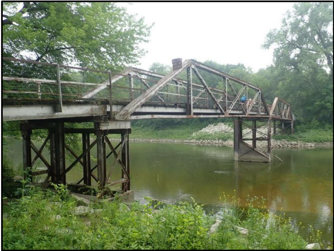
Above Photo: Side View Looking West at Bill Riley Trail Bridge over the Raccoon River