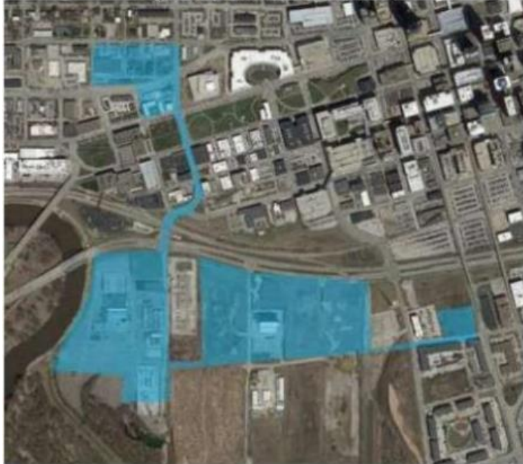
Map of the IRA District Boundary