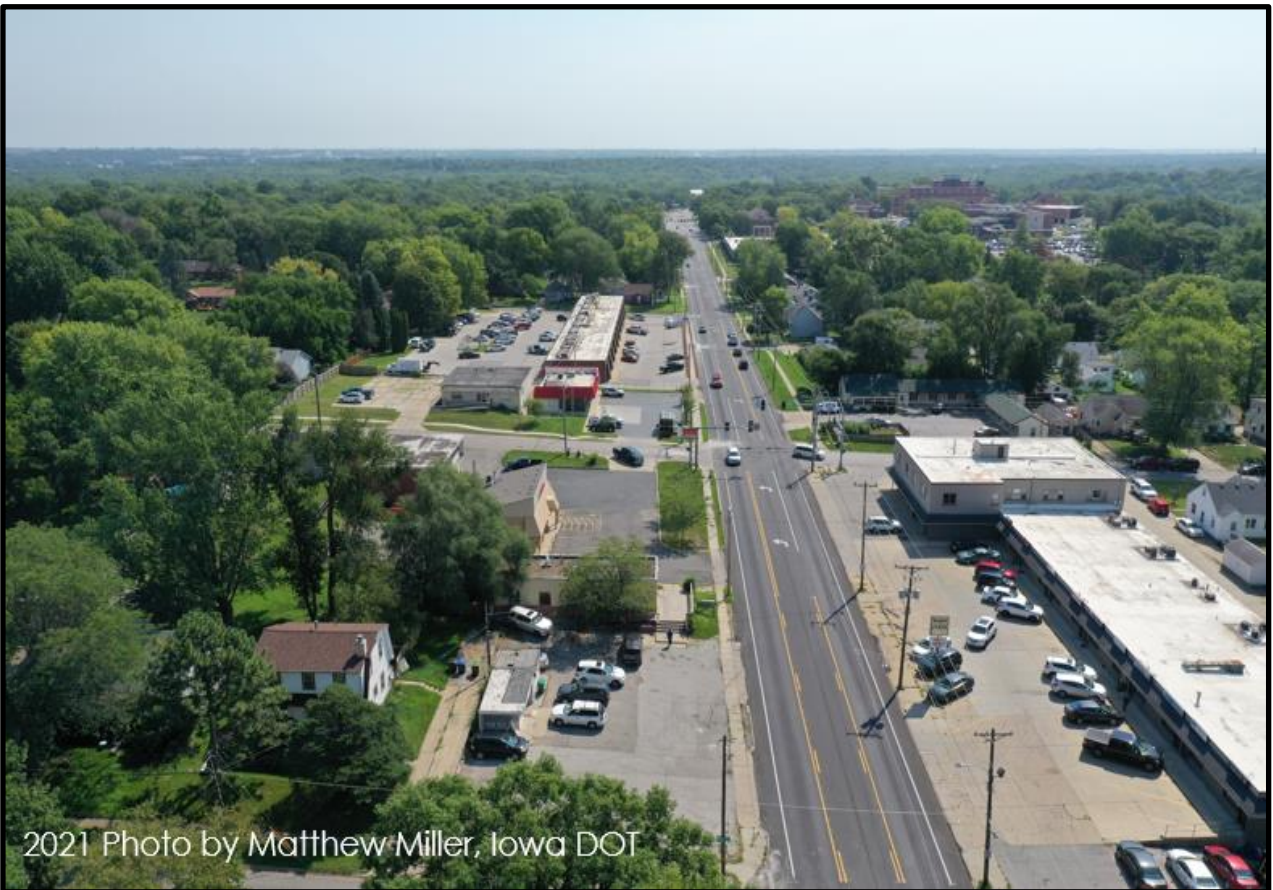
Above Photo: Douglas Avenue at 39th Street looking east taken after 2021 Pilot Project Installation