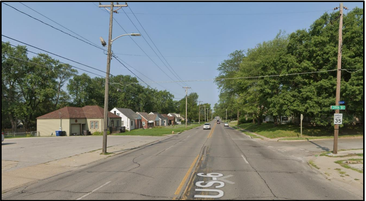
Above Google Streetview Image: Douglas Avenue at 39th Street looking west taken before 2021 Pilot Project Installation