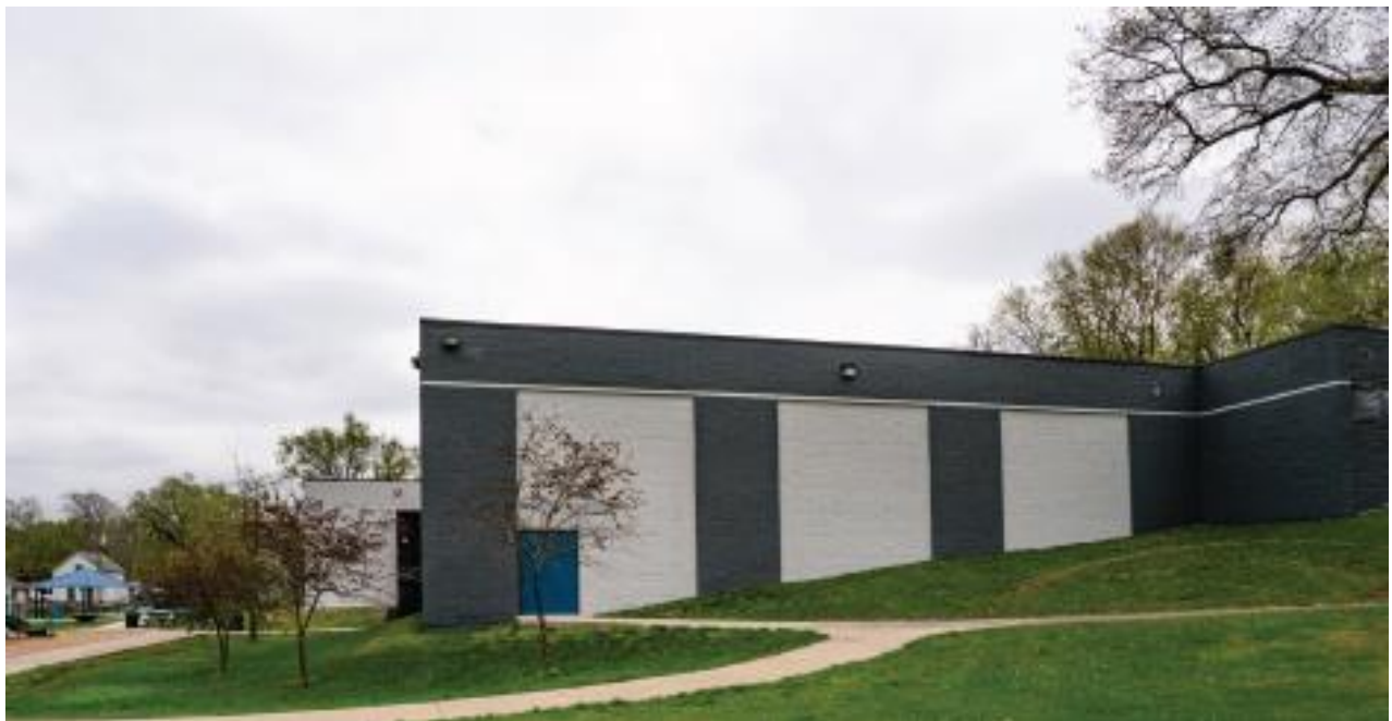
Existing Conditions of the Pioneer Columbus CRC Exterior