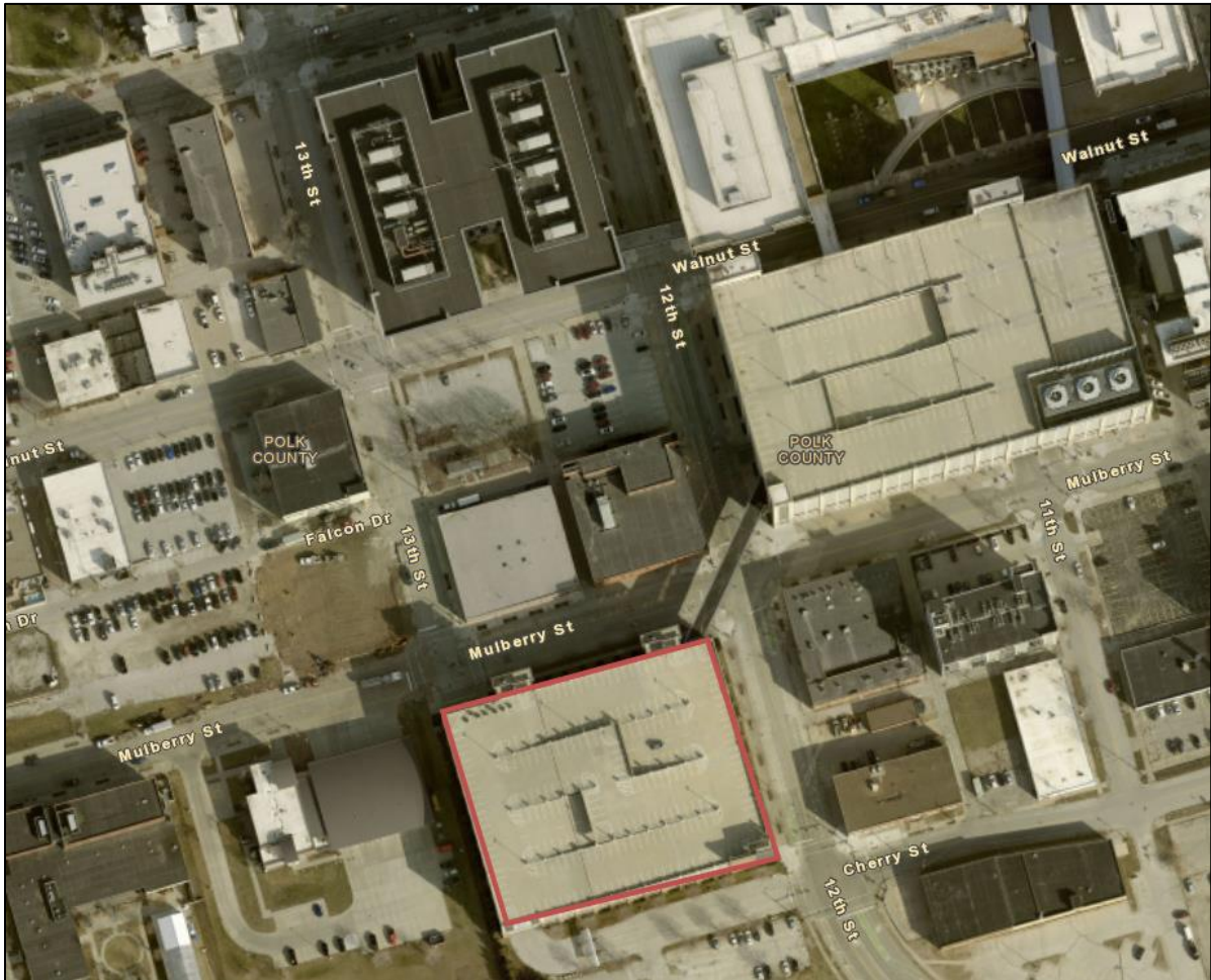
Exhibit: Parking Garage located at 1200 Mulberry Street