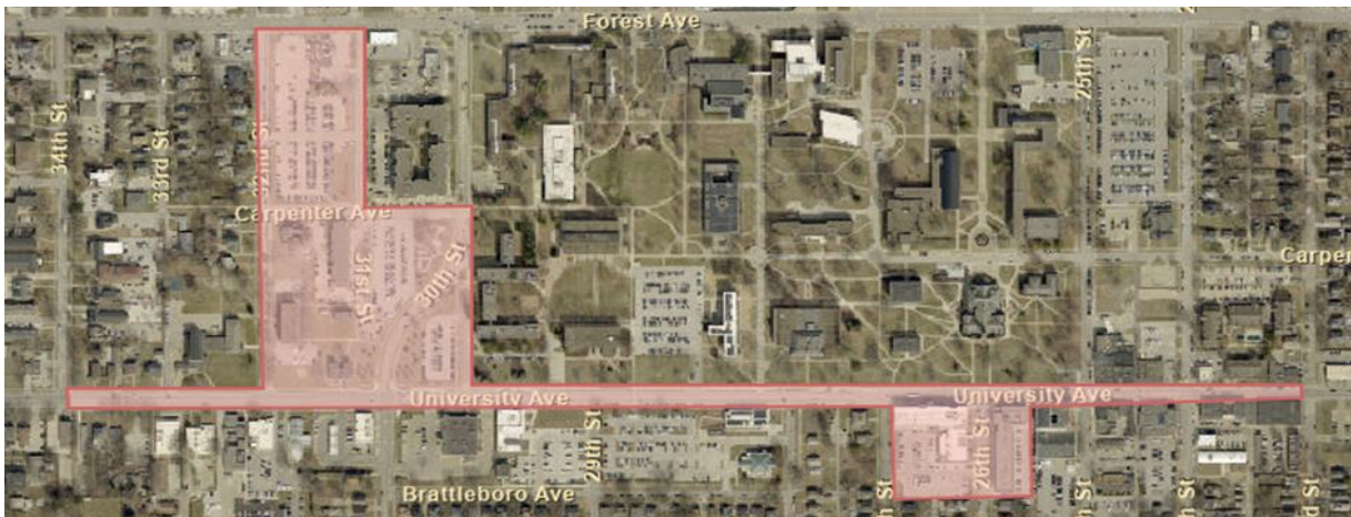
Pink is the proposed new Drake Urban Renewal Area