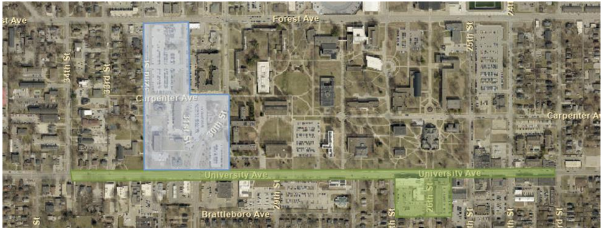
Green is the existing Drake Urban Renewal Area Blue is the Proposed Expansion Area