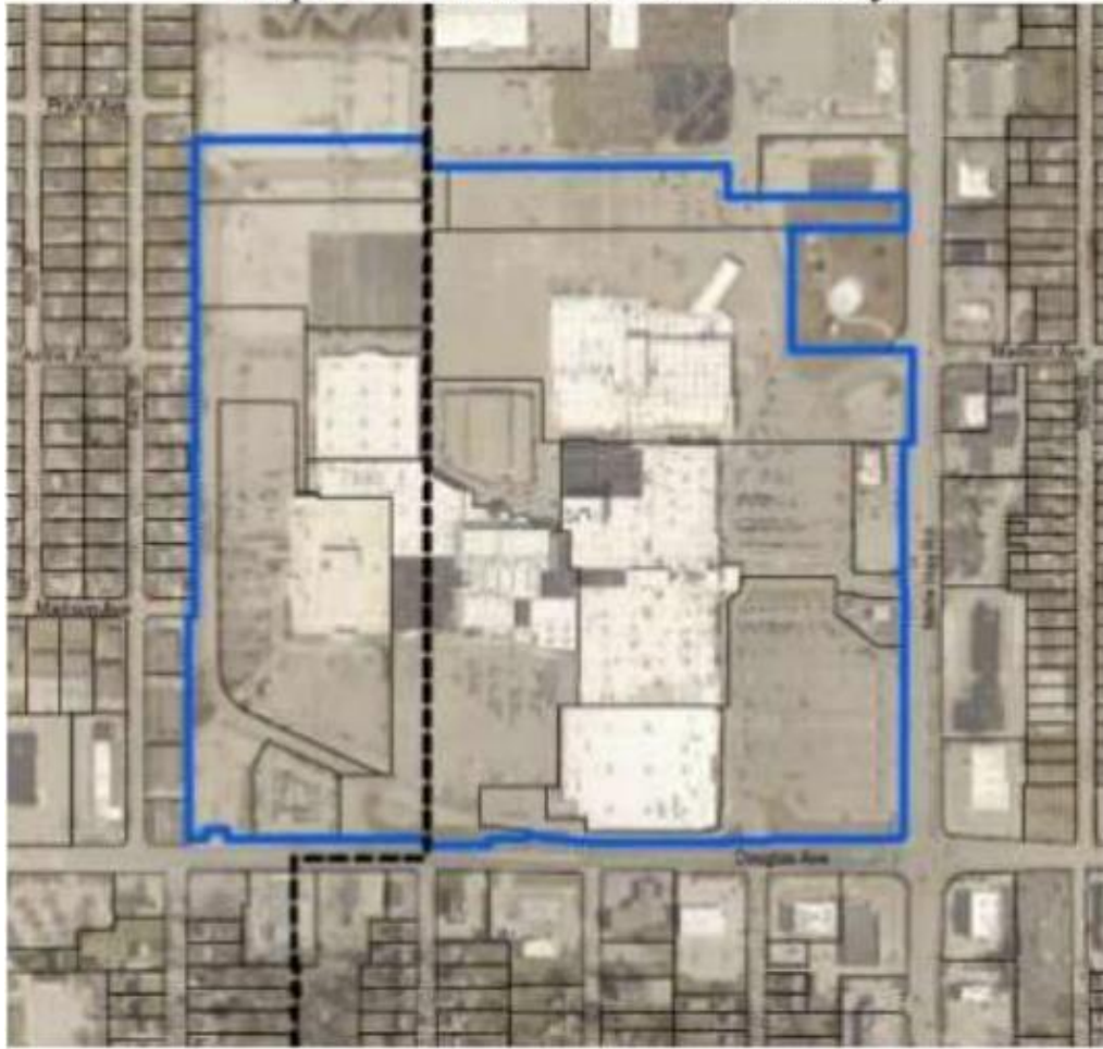
Map of the IRA District Boundary