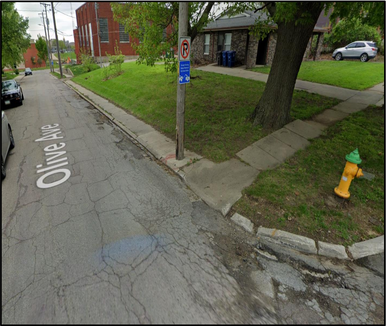
Above Image from Google Streetview, looking at south side of Olive Avenue, east of 18th Street where sidewalk will be replaced to provide separation from roadway (and utility pole conflict).