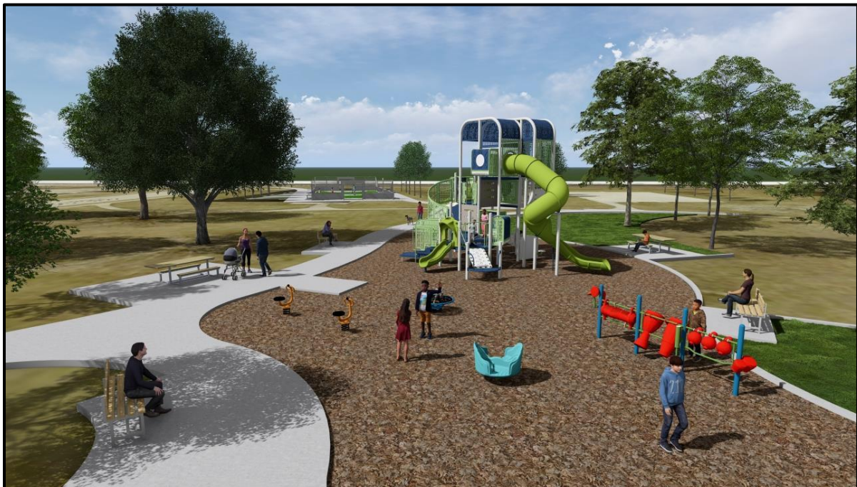
Cheatom Park Playground Improvements - Concept Rendering