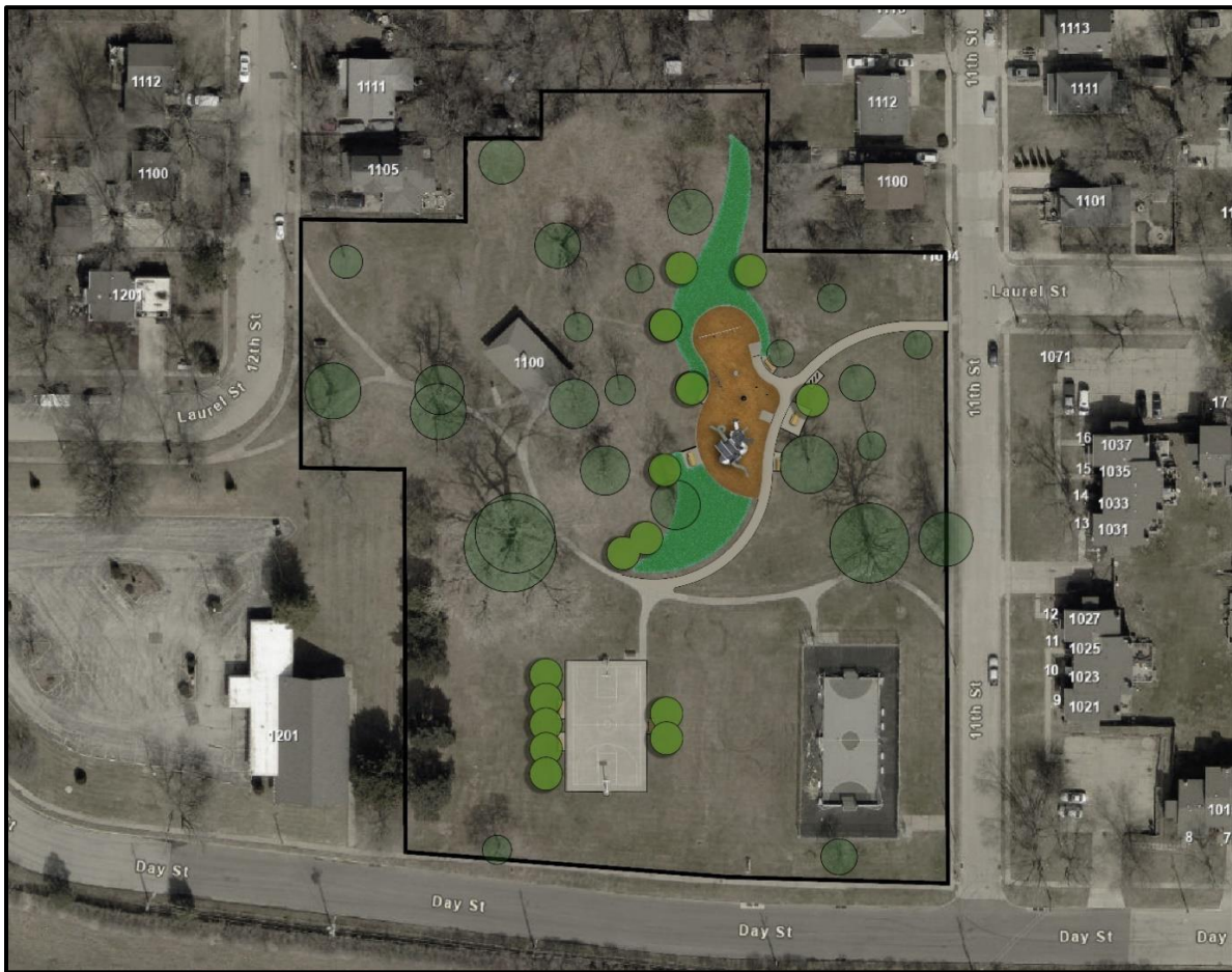
Cheatom Park Playground Improvements - Concept Plan