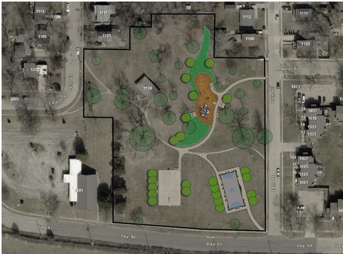
Cheatom Park Playground Improvements - Concept Plan