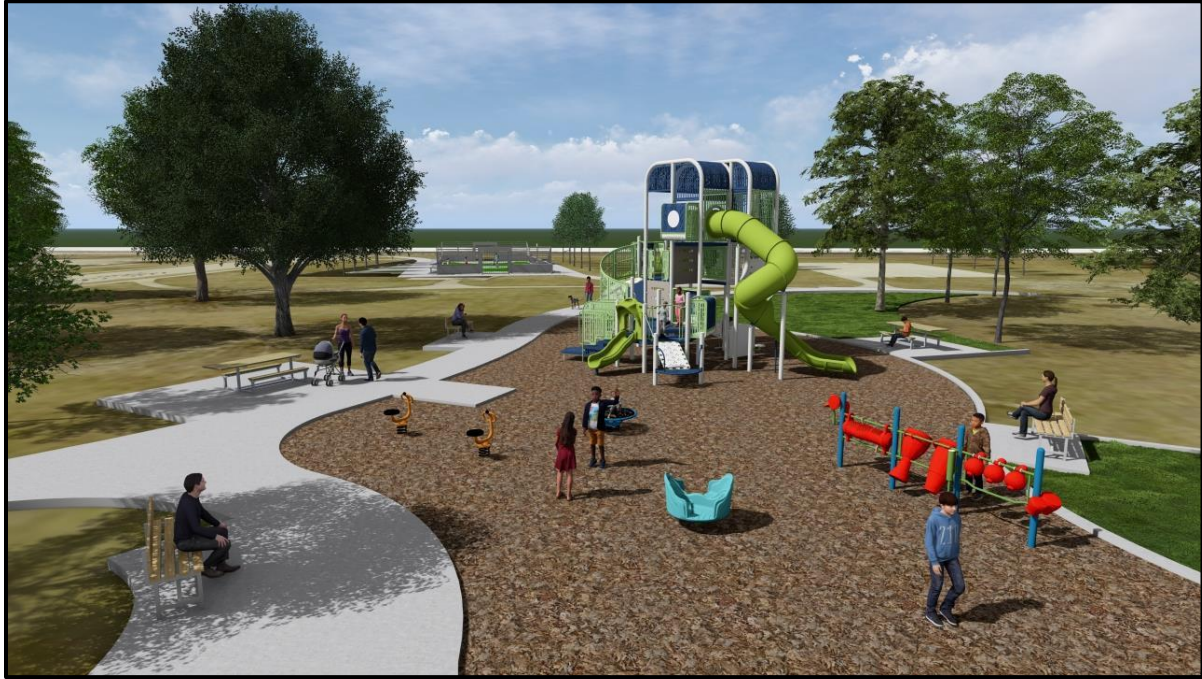
Cheatom Park Playground Improvements - Concept Rendering