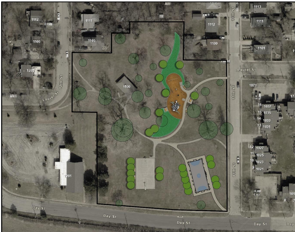
Cheatom Park Playground Improvements - Concept Plan