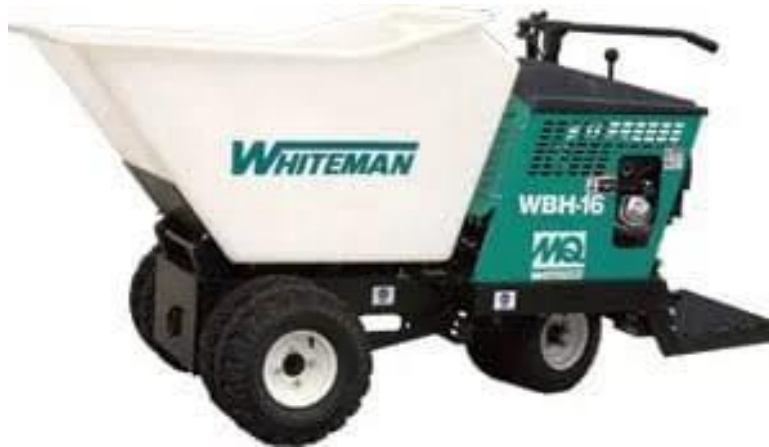
Concrete Buggy Vehicle