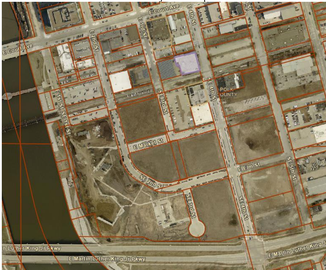
Project site map: