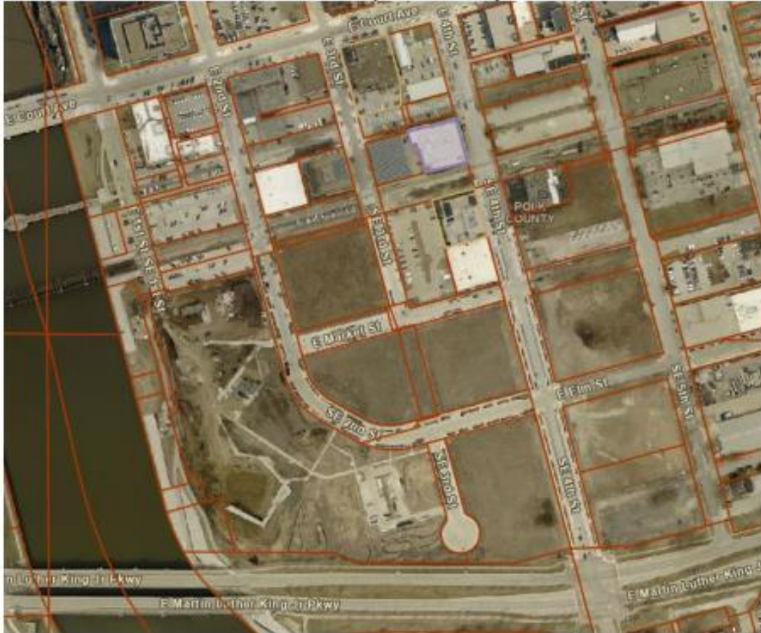
Project site map: