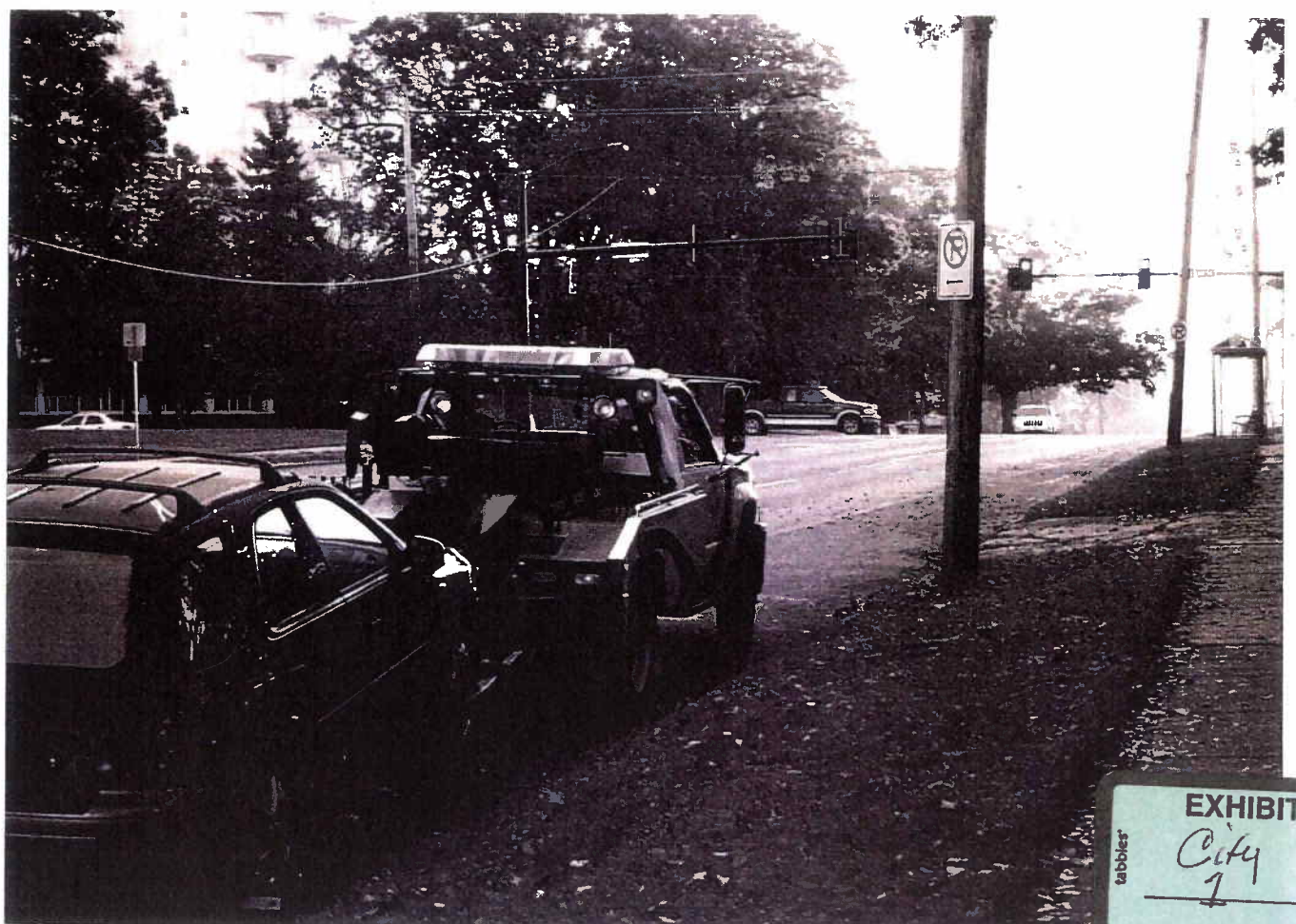
EXHIBIT City 1