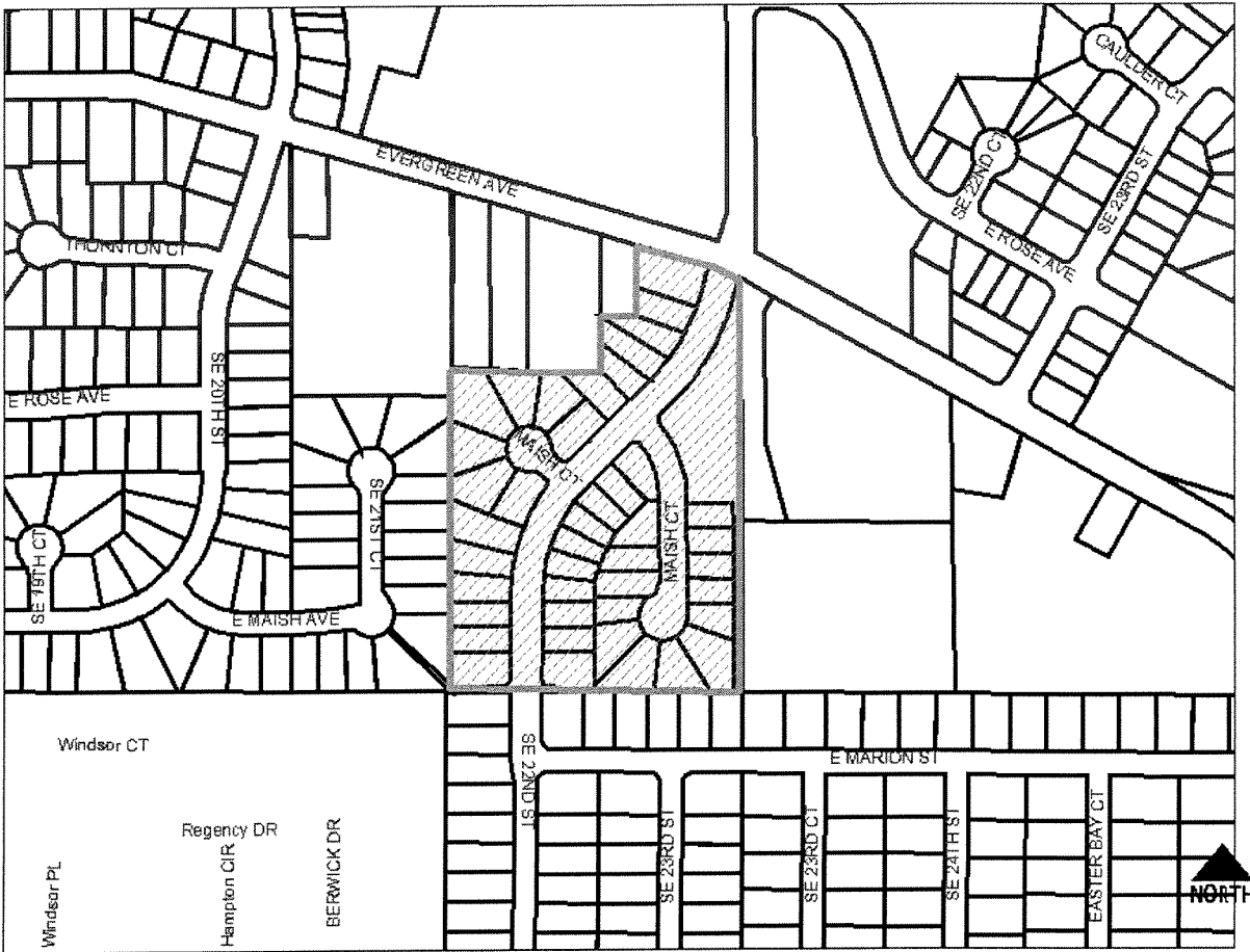
White Oak Park - R-6 Amendment - Evergreen Ave & SE 22nd St ZON2006-00032