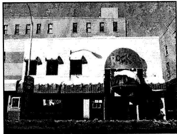
Approximate date of photo 03/04/2008