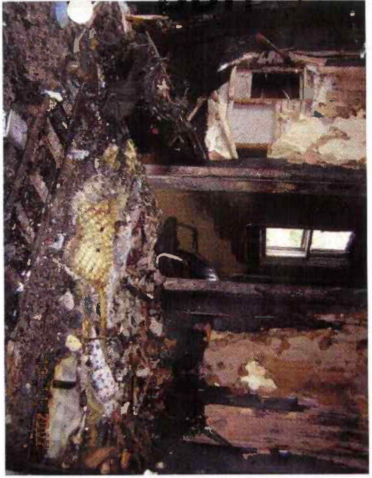
2ND FLOOR APT.