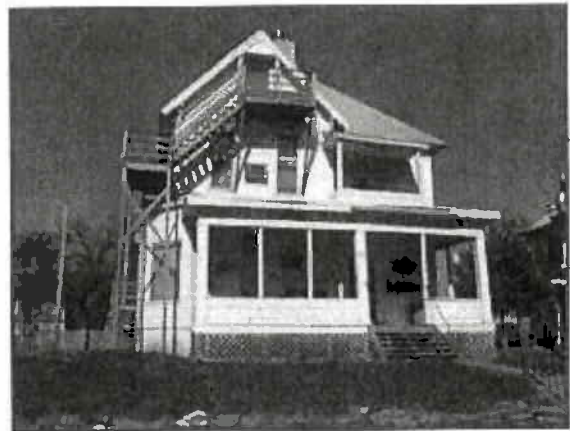
Approximate date of photo 04/13/2006