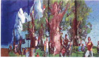
Artist: Barrie Lester Exterior Mural: Orchard Place/PACE @ Location: 8 th & High Streets