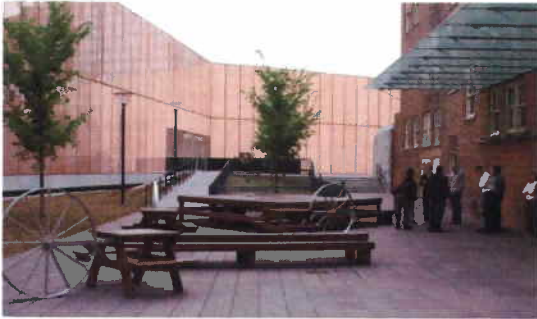
Artist: Siah Armajani Title: Temple Chess & Poetry Garden Location: 10 th & Locust Streets

The "Temple Chess & Poetry Garden" for example, illustrates the Foundation's ability to attract private funding. The total project cost was approximately $330,000; of that amount, private sources contributed $215,000, or 65% of the total, with the remaining sum of $115,000, or 35% provided by the Foundation. These levels of support reflect a match of approximately 3:1, which is an impressive result by any standard of professional fundraising.