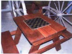
Artist: Siah Armajani Title: Temple Chess & Poetry Garden [Detail]

The Temple Chess & Poetry Garden was conceived, designed, and fabricated by internationally known artist Siah Armajani. The Garden is rapidly becoming a favorite gathering place, where people can go to simply enjoy the day or play one another in a game of chess.