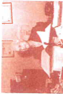
Gertrude E. Rush, First African American female licensed to practice law in Iowa