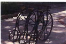
Artist: Tim Adams, Webster City Title: High Wheeler

The East Village hosted its second annual “ Rack ‘n’ Roll Project ,” funded in part by the Foundation, which culminated in commissioning five Iowa artists to create bike rack sculptures for installation throughout the historic East Village area.