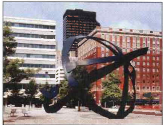
Title: "Crusoe Umbrella" Artist: Claes Oldenburg & Coosje van Bruggen Location: Nollen Plaza, Des Moines, IA

At the west end of the Park is another Oldenburg/van Bruggen work, purchased by the Meredith Publishing Company, titled " Plantain ", and immediately grabs the attention of visitors coming into the city center from the airport.