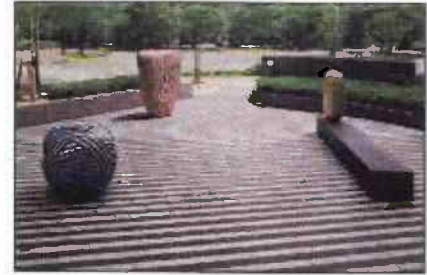
Artist: Jun Kaneko Mixed Media: Installation Location: Kansas City, MO