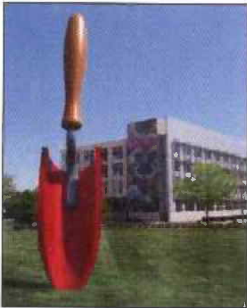
Title: "Plowman" Artist: Claes Oldenburg & Coosje van Bruggen Location: Meredith Publishing Campus, Des Moines, IA

The City is fortunate to have enlightened elected officials, urban planners, architects, community activists, and philanthropists, all of whom work with determined effort to make Des Moines a twenty-first century city. The sum of their efforts will help serve Des Moines in becoming known in the future as a creative, progressive, and open-minded place in which to live, work, and play.