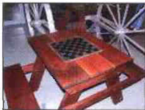
Artist: Siah Armajani Title: Temple Chess & Poetry Garden (Detail)

The Temple Chess & Poetry Garden was conceived, designed, and fabricated by internationally known artist Siah Armajani. The Garden has become a favorite gathering place, where people go to simply enjoy the day or play one another in a game of chess.