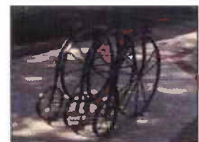
Artist: Tim Adams, Webster City Title: High Wheeler

The East Village hosted its second annual "Rack 'n' Roll Project," funded, in part, by the Foundation, which culminated in commissioning five Iowa artists to create bicycle rack sculptures for installation throughout the historic East Village area.