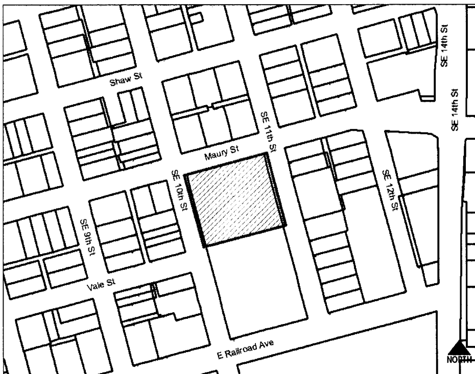
GDMHFH (Rose of South Des Moines PUD) - 1005 Maury Street ZON2009-00203