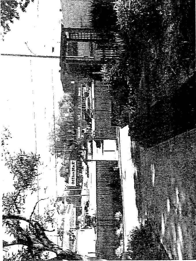
A wooden fence and pedestrian archway provide a transition and connection between residential on Linden and the back of commercial buildings on Ingersoll Avenue.

New commercial development and expansion of existing commercial along major corridors should front upon and have primary access from the major corridor and not from an adjacent residential side street. It is inappropriate to introduce commercial traffic into or through a residential area. The impacts of such commercial expansion upon the adjacent residential neighborhood, as outlined in this section, should be a primary consideration in determining the appropriateness of the development request.