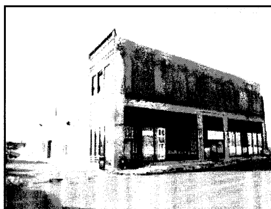
Approximate date of photo 02/23/2010